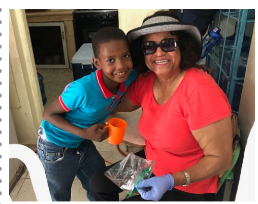
Counting meds with a friend