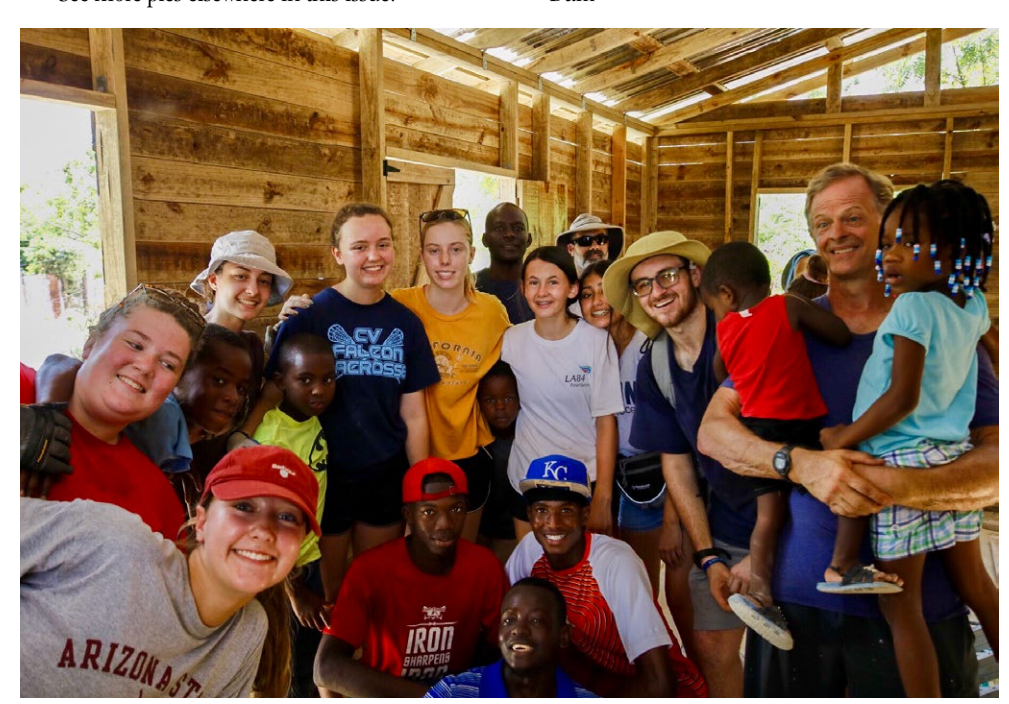
Above: Group photo from the last day, inside the house we built