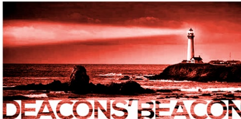
Deacons' Beacon is on summer vacation. We will see you again in August!

Other projects will include replacing the 60s-vintage heating and air-conditioning units in our CFC/ Christian Education classrooms, reconfiguring the Christian Education offices (to give Ashley